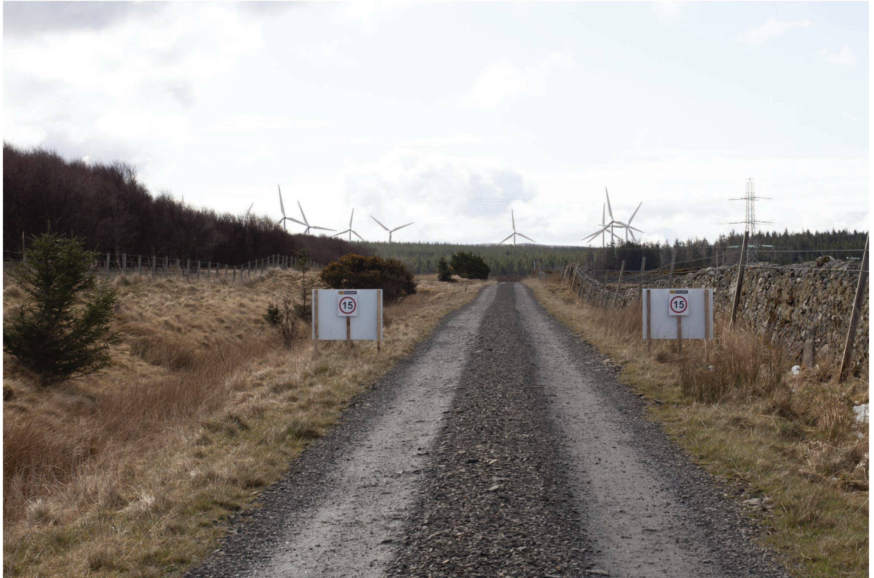
Viewpoint 2: Reay Footpath