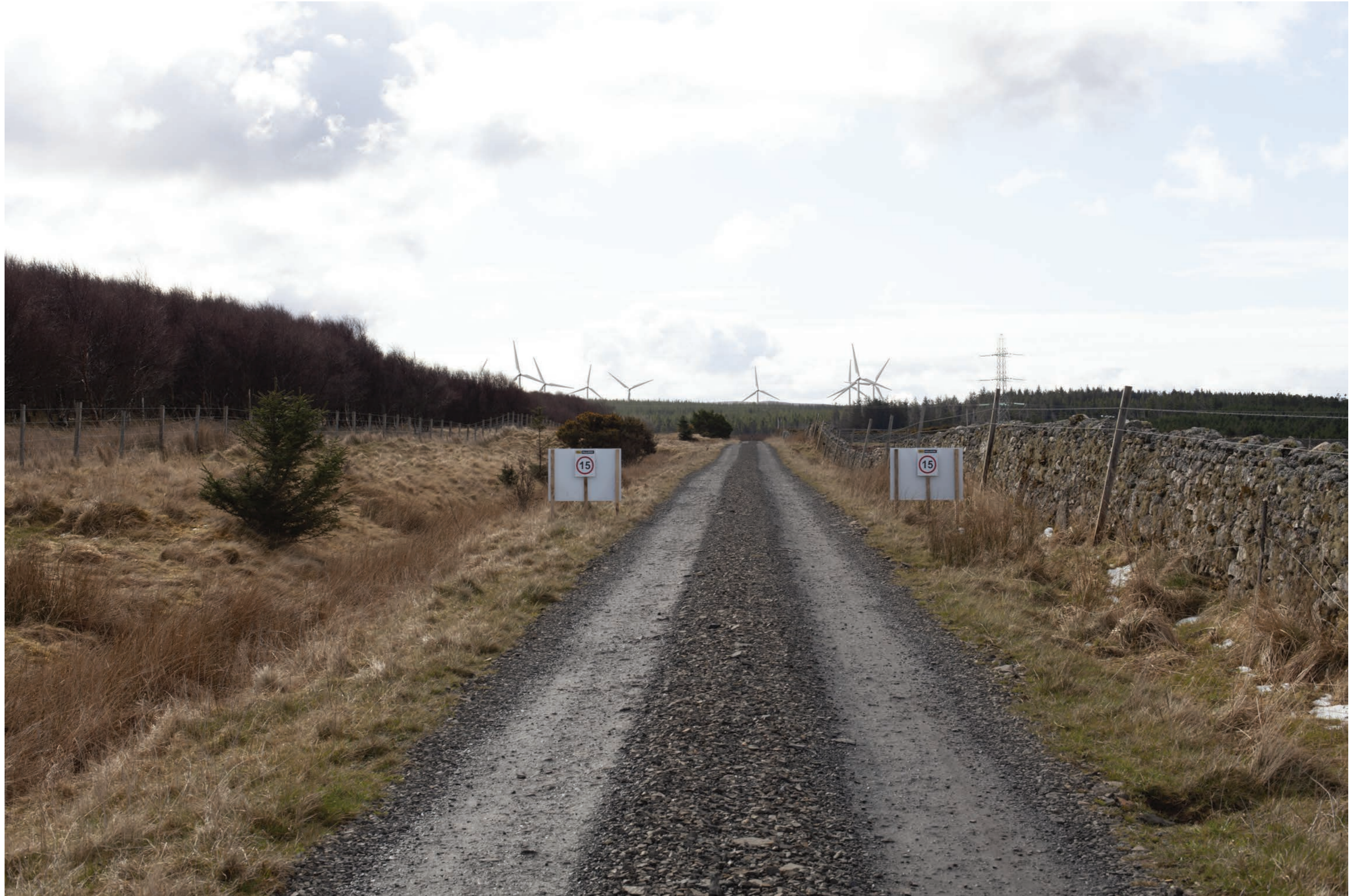
Viewpoint 2: Reay Footpath