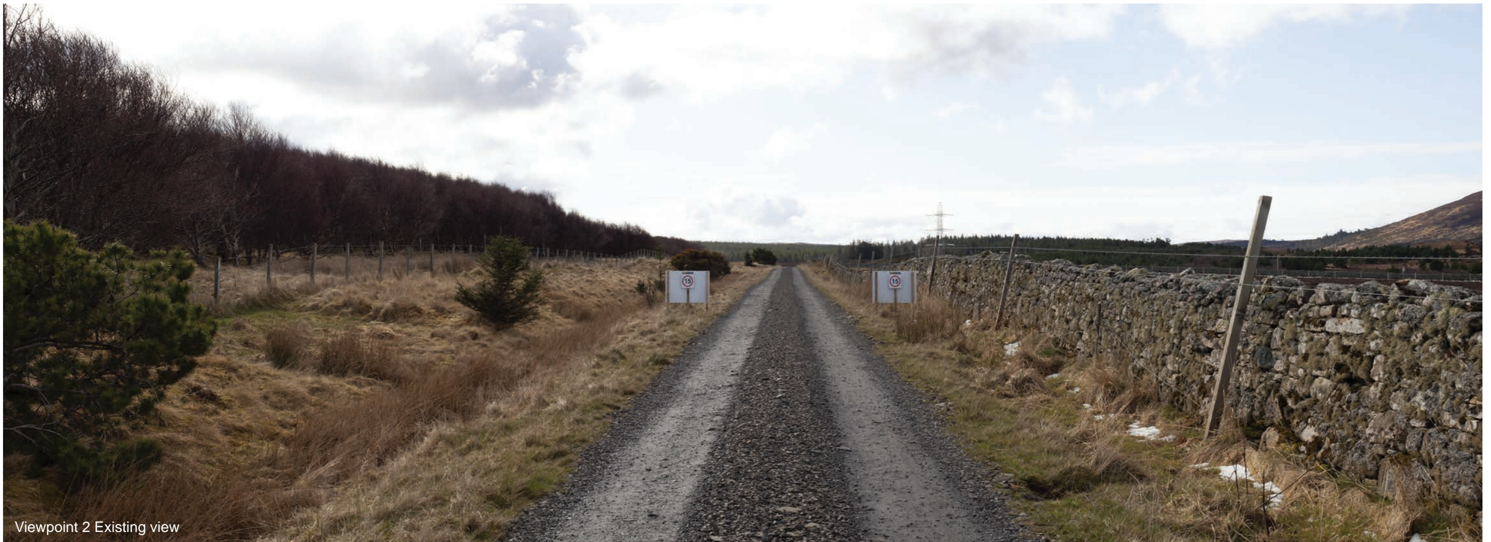
Viewpoint 2 Existing view